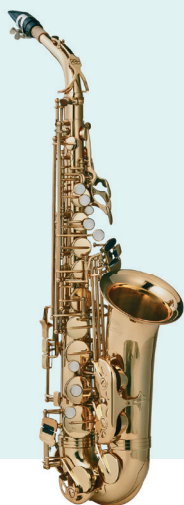
Belgian invention - Adolphe Sax

You will be attending a regular high school where they only offer the basic generic subjects. The other subjects in your course are related to music, both practical and theoretical. You can specialize in jazz or classical music. When you enroll for this program a placement in a school that offers a music program is guaranteed.