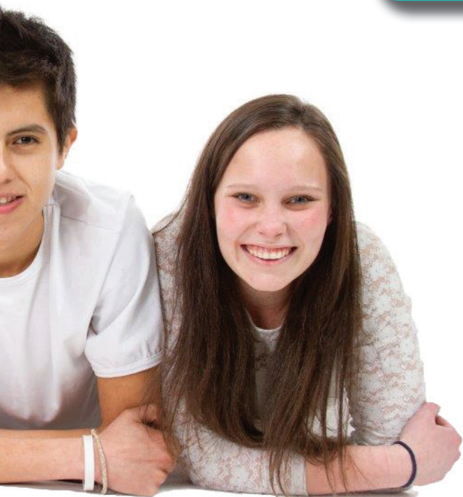
with his 2 host sisters

Language classes: You are encouraged to attend a Dutch course outside of school. When you finish the course successfully, you will receive a reimbursement of the course and necessary books up to 100 Euro.