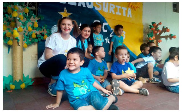
The Community Service Program

The student will have the opportunity to attend to and experience the Paraguayan school system, which is very different to its European equivalent, while getting to know the culture with friends and a host family all contributing in an eye opening experience.